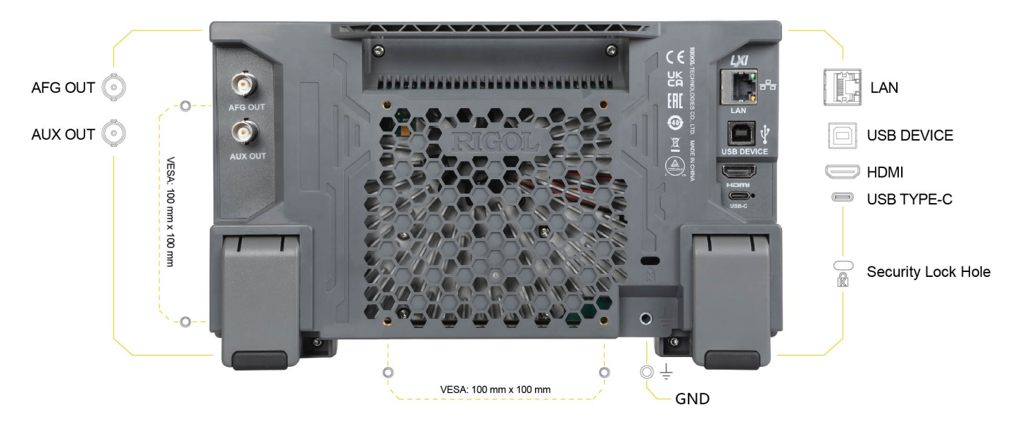
265.35 mm (W) \times 161.75 \text{ mm} (H) \times 77.38 \text{ mm} (D)