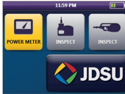
Intuitive smartphone-style user interface High-contrast, color touch screen with menu icons