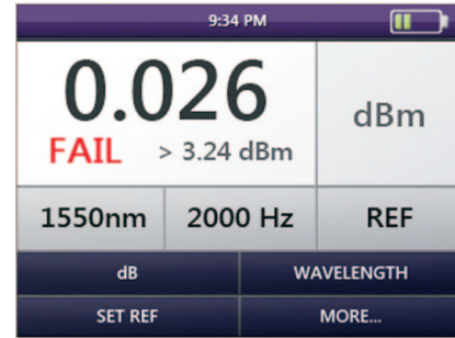
Accurate measurement and simple operation Make quick, easy dual-wavelength measurements at 850 and 1300 nm or 1310 and 1550 nm using saved reference levels.