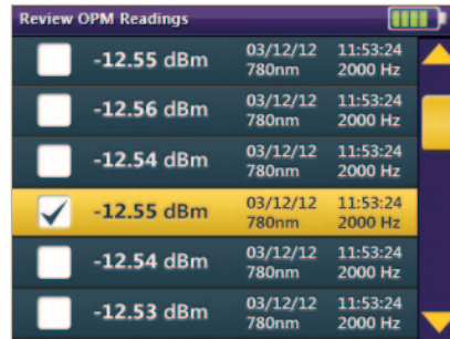
Store inspection and measurement readings on the device Store up to 10,000 measurement results on the device for export to PC.