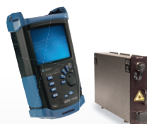
Compact Platform FTB-200