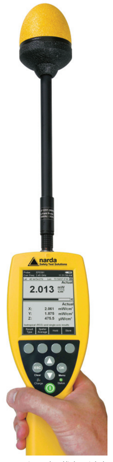
Rugged and lightweight housing, designed for easy one-hand operation