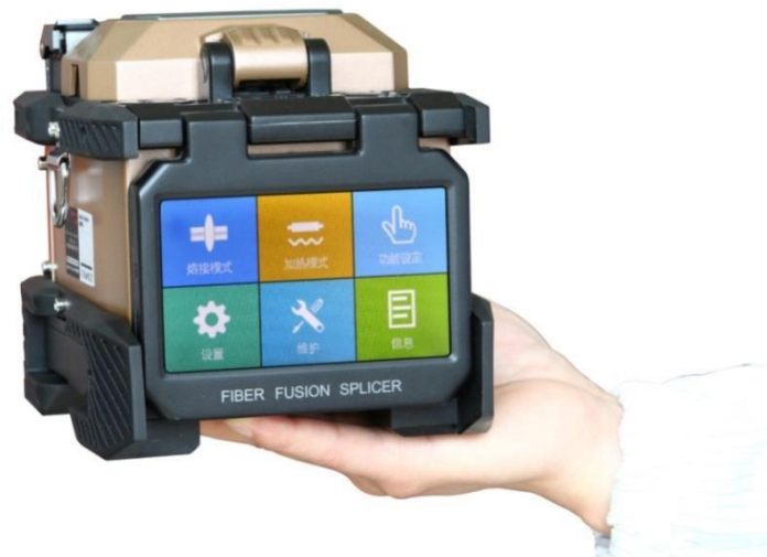
Lift it by one hand

Small in size and light in weight, the splicer is easy to carry and can be lifted by one hand.