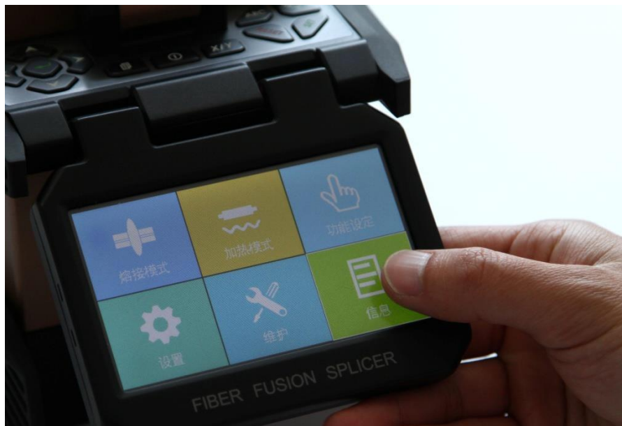
Entirely new GUI graphical interfaces and touch screen

AD456 uses entirely new GUI graphical interfaces and touch screen in design. Operators can set up the splicer and get to know relevant information of it simply and directly by graphical interfaces.