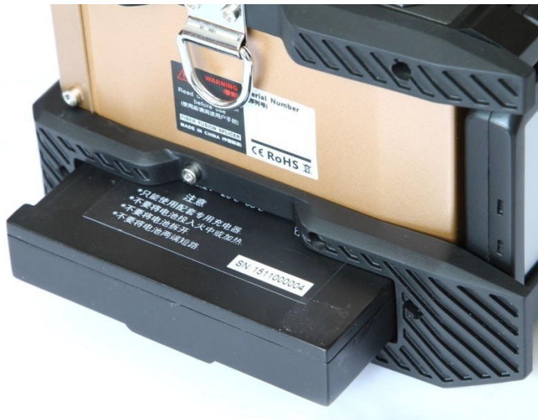
Built-in pluggable lithium battery with large-capacity

The built-in pluggable lithium battery with large capacity can answer working demand lasting all day long (typical 220 times of fusion splicing and heating cycles).