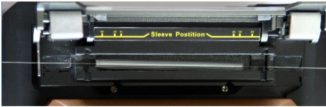
Hear and detection unit