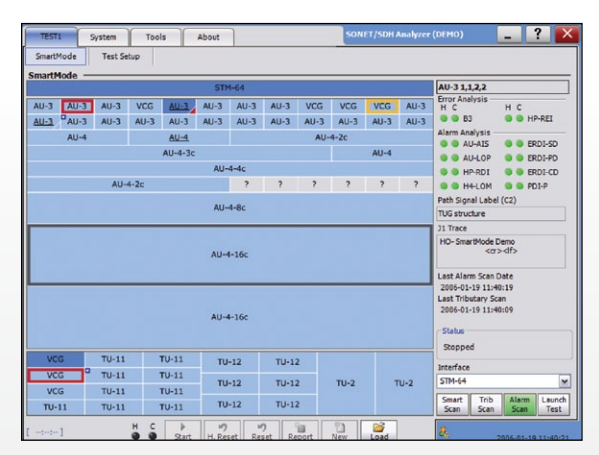
FTB-8115 SmartMode: multichannel signal discovery with real-time alarm scan (shown in the FTB-500 user interface).

SmartMode automatically discovers the signal structure of the OC-n/STM-n line, including mixed mappings. In addition to this in-depth multichannel visibility, SmartMode performs real-time monitoring of all discovered high-order paths and user selected low-order paths simultaneously, providing users with the industry's most powerful SONET/SDH multichannel monitoring and troubleshooting solution. Real-time monitoring allows users to easily isolate network faults, saving valuable time and minimizing service disruption. SmartMode also provides one-touch test case start, allowing users to quickly configure a desired test path.