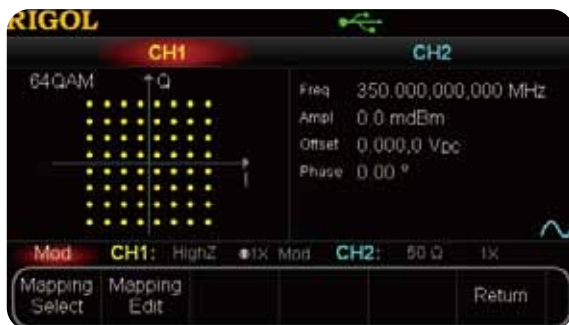
IQ Mapping Selection