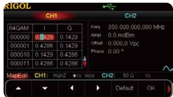
IQ Mapping Edit